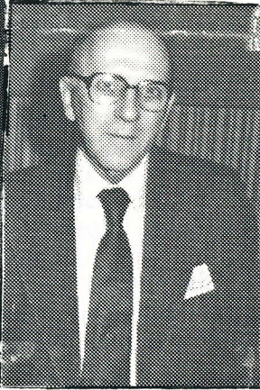
Van Vorst 1982 Turnquist 1982