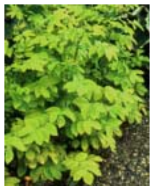
Filipendula ulamaria 'Aurea'.