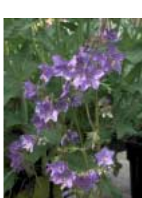
Polemonium (Jacob's Ladder)