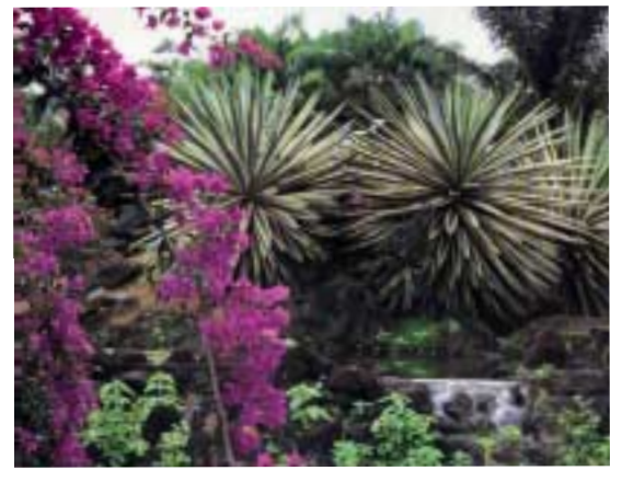
A typical scene, you may see

The March program will show what those that took Arboretum trip to new Zealand saw and enjoyed. The medium for this show will be slides taken and shown by Peter Olin. It will include views from the cities of Auckland, Wellington, Christchurch, and Queenstown, plus the podocarp forest and Milford sound. Some of the highlites will be slides of the new Botanic Garden in Auckland and some private gardens, the Wellington Botanic Garden and Christ Church Botanic Garden, and some wilderness areas. It sounds like this will be a delightful program with some hortcultural scenes we don't normally see. Come on down, up or across as the case my be, I'm sure you will enjoy. Not only that, there will be some good conversation and a good meal.