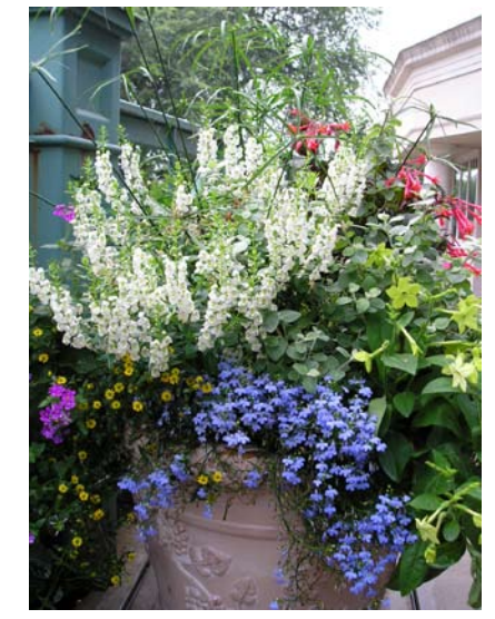
Angelonia 'Angel Mist'