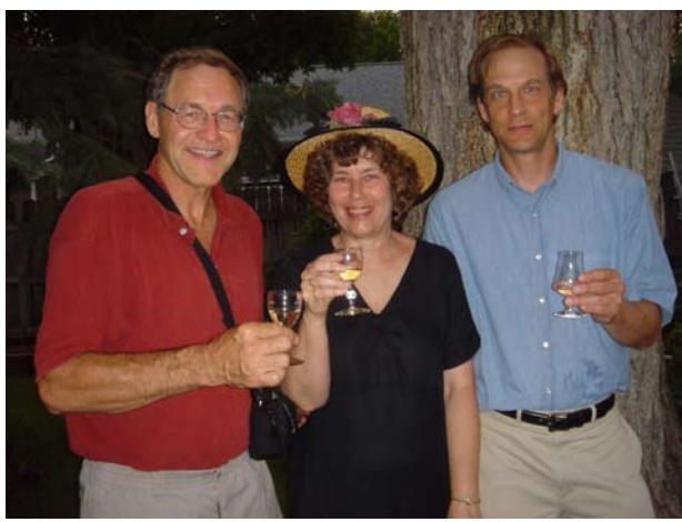
A Toast To MGCM