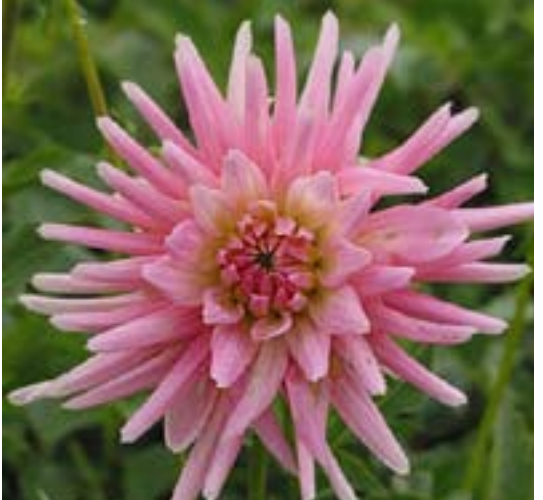
Dahlia 'Park Princess'

this is simply an excellent grower and prolific bloomer. 'Park Princess' forms a nice bushy plant about 24" tall, and the pink cactus-form flowers are always a standout. And it's very easy to find the tubers -- no need to go to a specialty grower to get it. Dahlia snobs may turn up their noses at the Princess, but it's always a favorite. There are getting to be a lot of nice dwarf dahlias. 'Fascination' has very red stems and leaves and a fuchsia peony flower. And 'Ecstase' was great in 2004, less exciting in 2005, when the heat