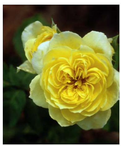
Easy Elegance Rose 'Tahitian Moon'