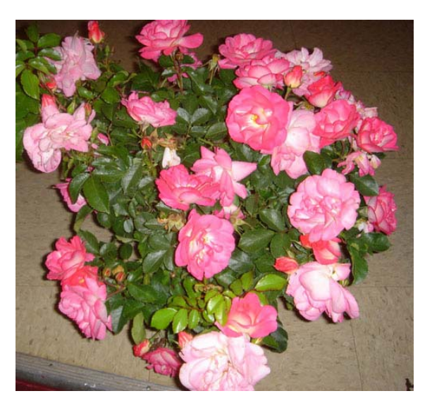
Easy Elegance Rose 'Sunrise Sunset'