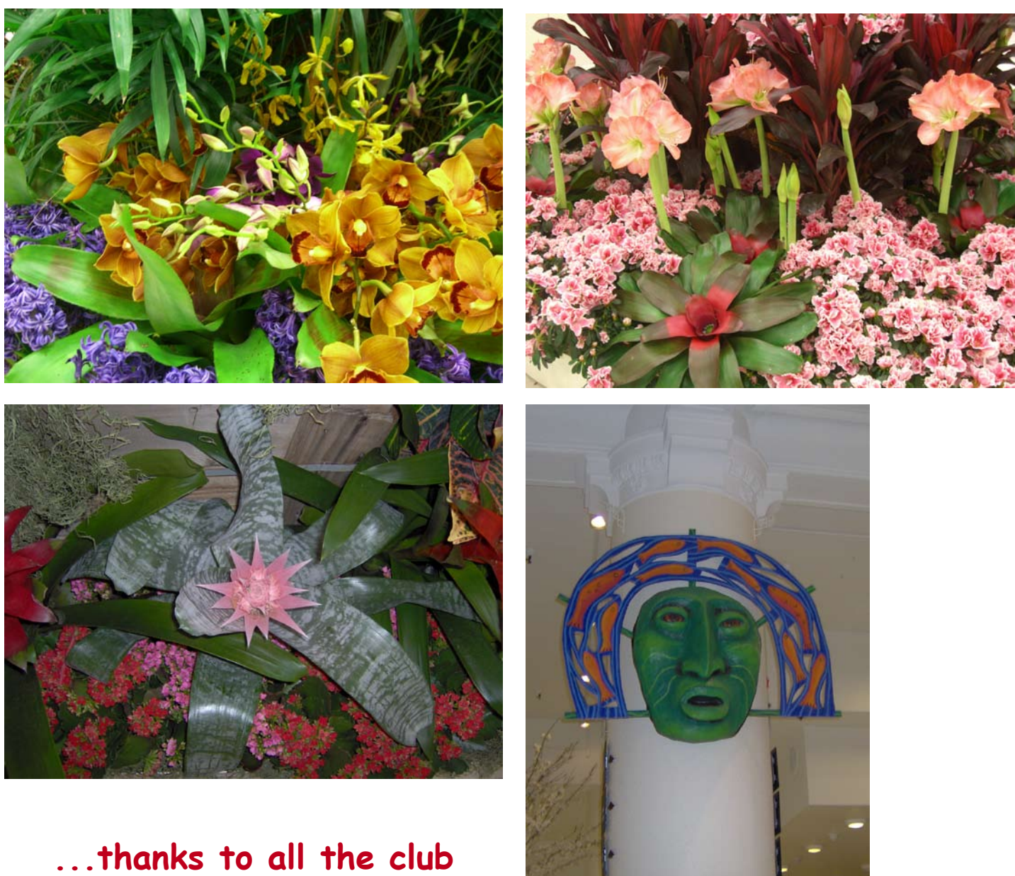
...thanks to all the club members who supplied these wonderful photos.