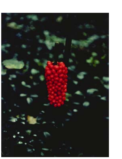
Fig 1.0 Arisaema seed pod

This species flowers from April to June. The fruits ripen in late summer and fall, turning a bright red color (see figure 1). If the seeds are freed from the berry they will germinate the next spring, producing a plant with a single rounded leaf. The seedlings will flower in about 3 years. (cont. on page 9)