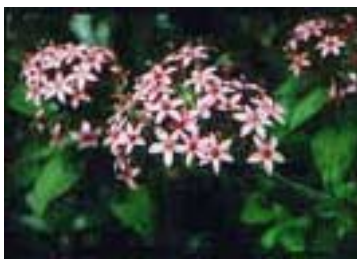
Pentas lanceolata (rose pink selection)

The catalogs for 2003 are already arriving. I think I'll stop writing now and settle in with the new Thompson and Morgan catalog and see what I should try next year!