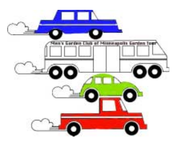
There all going to the Mens Garden Club of Minneapolis Garden Tour. See you there.

There are undoubtedly more interesting red and purple plants, but this is a start. If you don't have all of these, it's time to go shopping! See page 10 for more pictures.