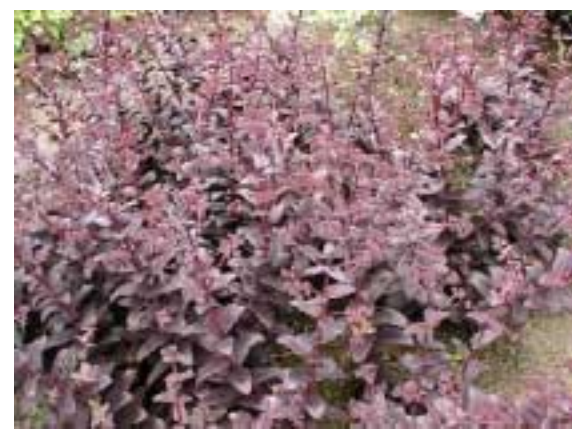
Sedium 'Purple Emperor'