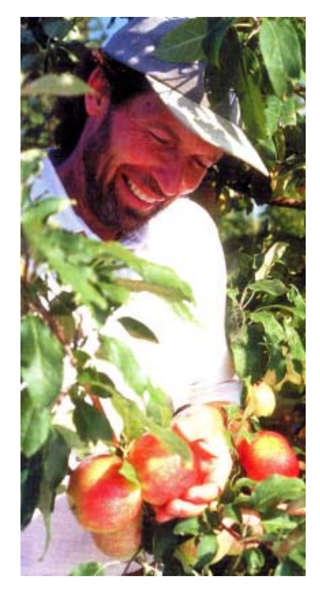
Our Speaker showing the Zestar apple

This was an excellent presentation and an interesting program.