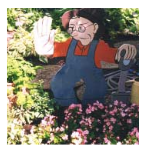
A scene in Koopman's Gardens

Preliminary plans have been set for the August 12, Sunday tour. The tour will consist of three gardens. The last garden will be at Roger & Kak Koopmans where we will have a catered meal in thier garden. More details will be forthcoming.