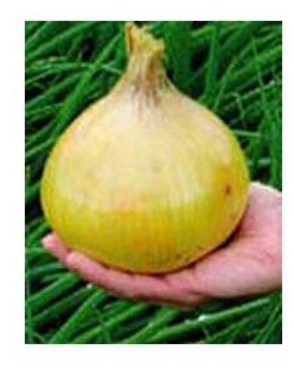
The Garden Spray Page 4 www.minneapolismensgardenclub.org