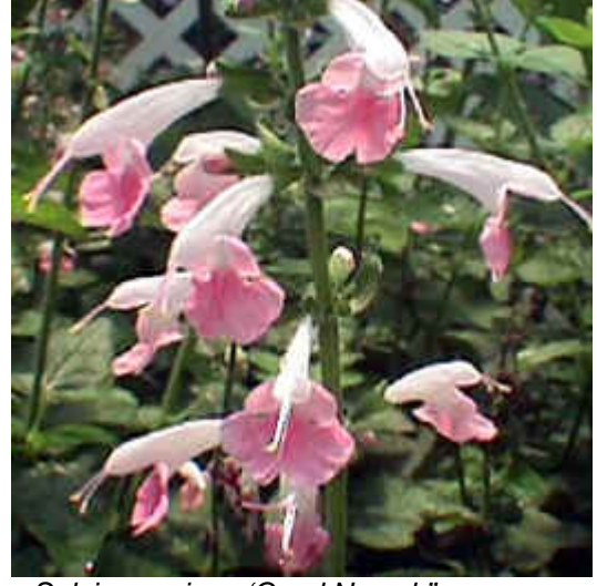
Salvia coccinea 'Coral Nymph"