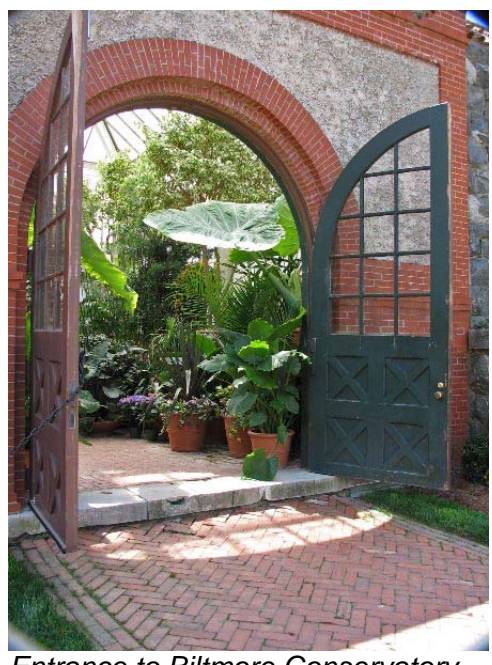
Entrance to Biltmore Conservatory

Having to change our anticipated outdoor focus led to plan B. Among other choices, it meant spending a bit more time in the wine-tasting room! We spent more time looking at the indoor winter garden--a monstrous domed conservatory with palms, plants and massive flower arrangements--and the outside conservatory, where philodendron-like leaves grew the size of umbrellas.