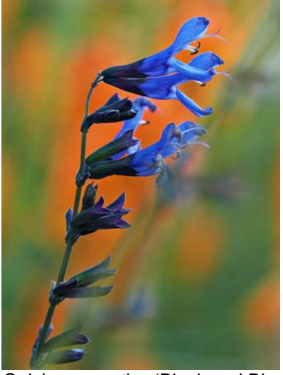
Salvia guarantica 'Black and Blue'

If you haven't already, plant a few salvias and some onions and plan to bring them to this year's FFF. It is great fun!