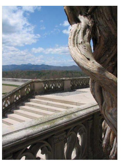
View from the Biltmore