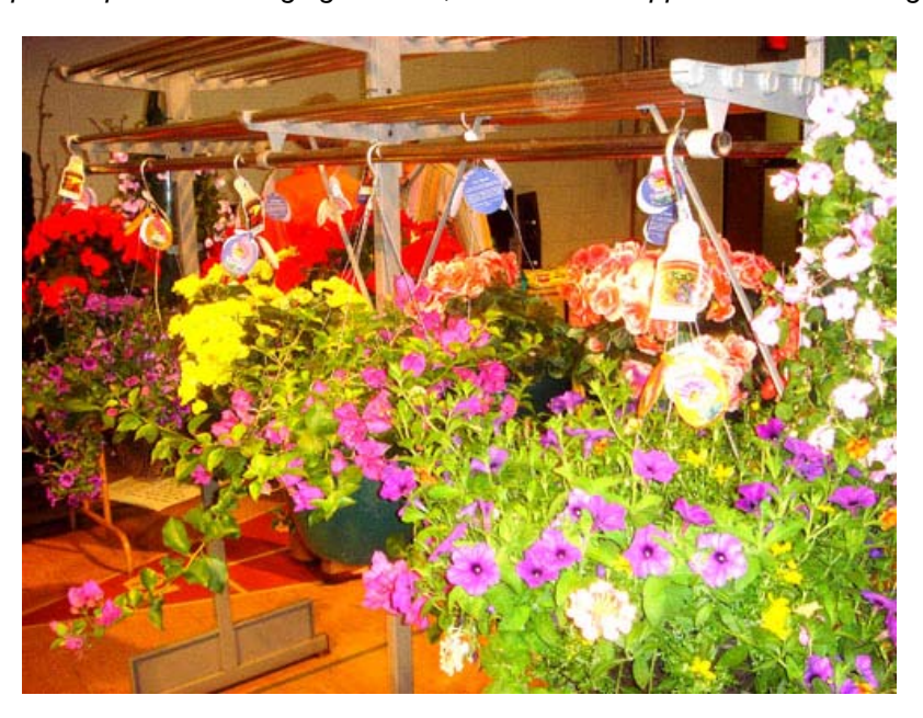
The Garden Spray Page 10 www.minneapolismensgardenclub.org