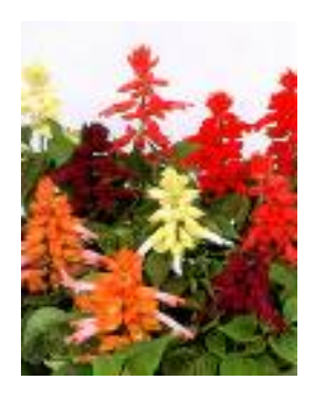
The many colors of Salvia splendens