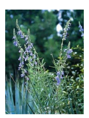
Salvia azurea 'Nekan'