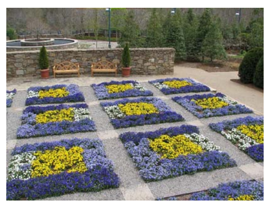
Pansy Garden at N.C. Arboretum

At the airport going home, we smiled to read these two quotes found on one wall: