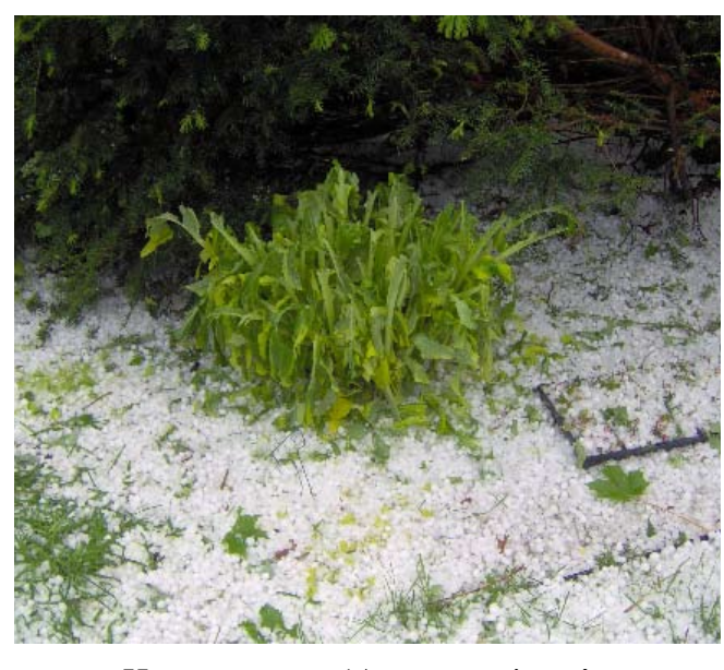
Hosta montana 'Aureomarginata'

Time will only tell whether the dahlias and tomatoes near the house that got buried in hail coming off the roof will recover or not. And the hostas. Oh, the hostas. I had just been thinking earlier in the day how the cool spring had been so good for the hostas, and how beautiful they all looked this year. Now we just have stems.