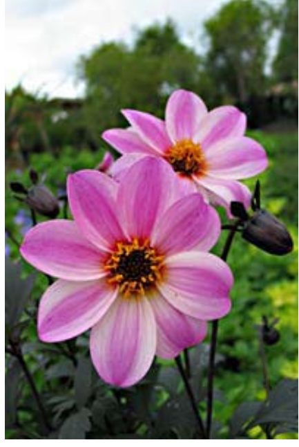
Dahlia Mystic Illustion

flowers all season on cascading growth. No deadheading needed.