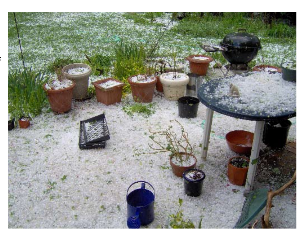
The Garden Spray Page 4

I guess I better go out and survey the damage once again! See you all at the club meeting!