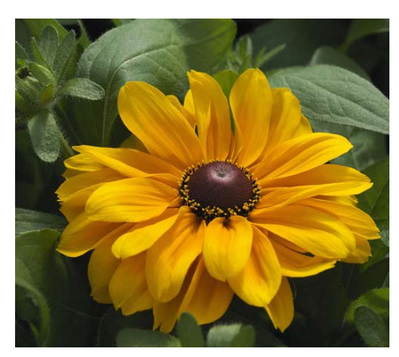
Rudbeckia 'Tiger Eye Gold'