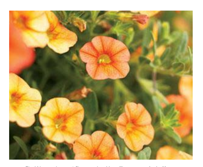
Calibrachoa 'Superbells: Dreamsicle"

Calibrachoa Superbells Dreamsicle (pictured) and Calibrachoa Saffron offer abundant, small petunia like