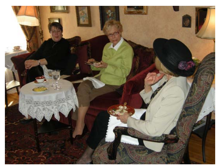
Convivial conversation at the tea