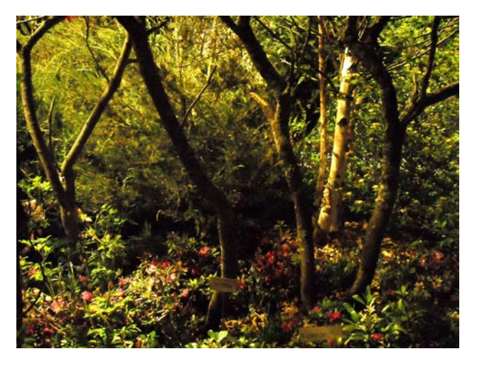
The flowershow included settings of both whimsy and enchantment.