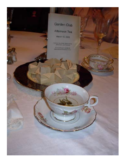
Attention to every detail transported guests to a different place. Each dish and fork, the warm surroundings, perfect morsels and, of course, enlightened conversation made the tea an exceptional afternoon.