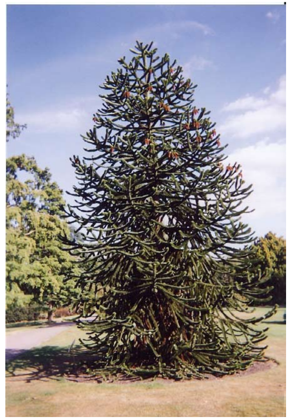
Monkey Puzzle Tree

A relatively new addition to Kew is the Princess of Wales Conservatory which opened in 1987. Inside is 10 climate controlled zones with plants from succulents to orchids, each in their own niche. I spent much of the afternoon admiring the diversity we find on earth and appreciating the efforts of those who seek to preserve that diversity.