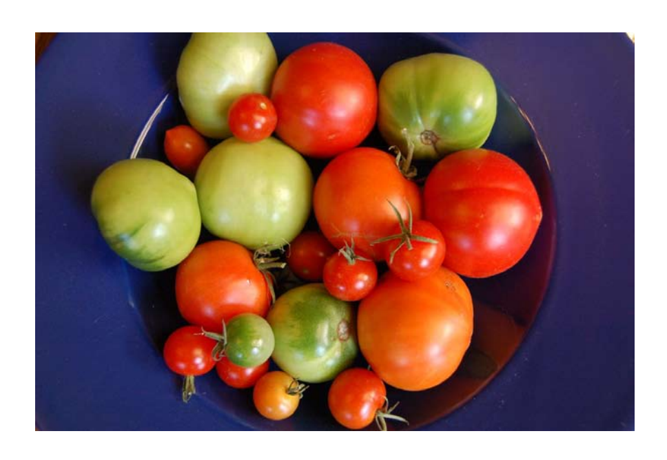
Last of the summer's harvest