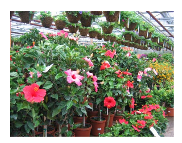
Hibiscus ready for sale