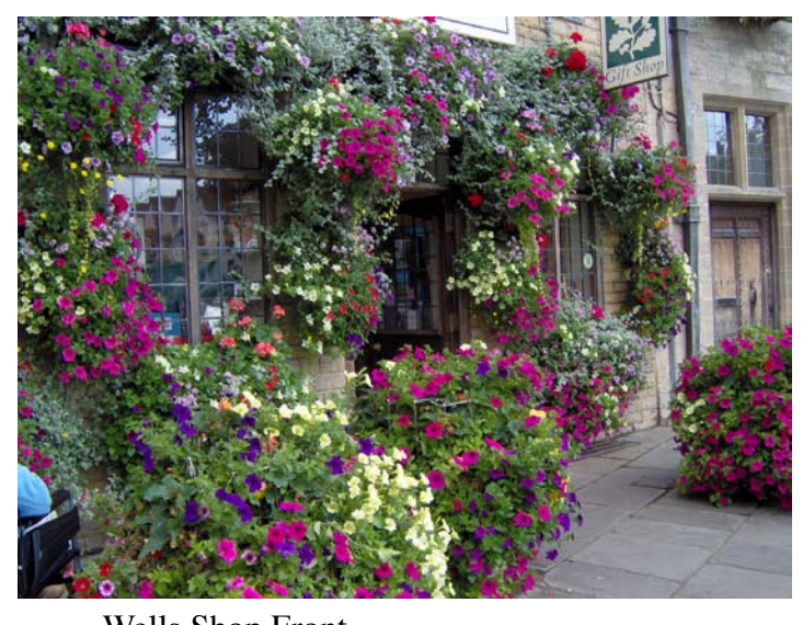
Wells Shop Front