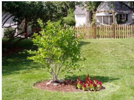
The magnolia holds center stage at Les and Elaine Spiegel's