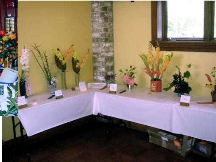
Tables of beauty!