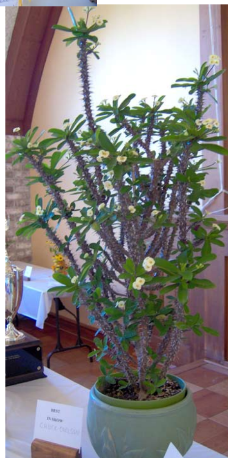
Chuck Carlson's Euphorbia millii (Crown of Thorns)