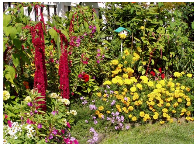
Don Morgenweck's garden with "Love Lies Bleeding"