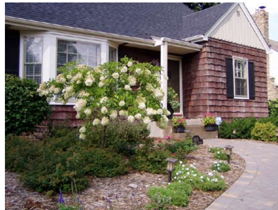
Front walk @ Cari Tully's