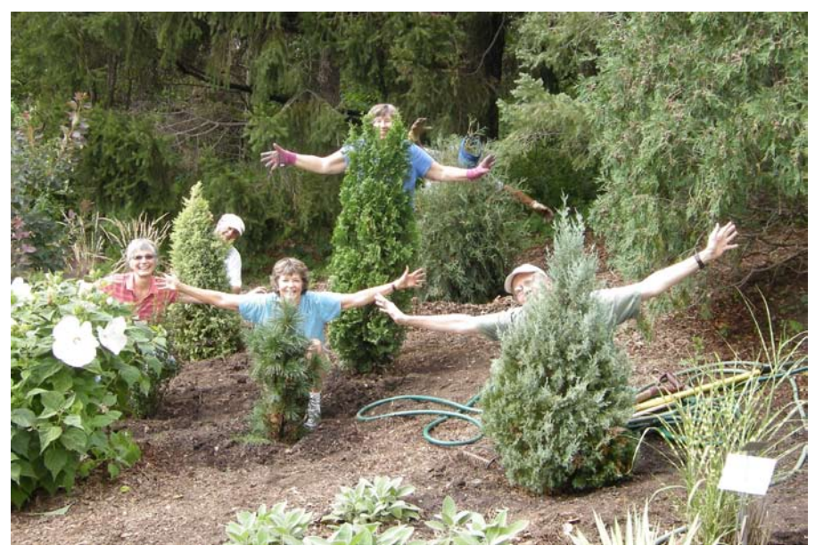
We are ONE with the trees. 'Mollie's Pillar' Barberry, 'MT Gold Cone' Juniper, 'Sharla-Column' Mugo Pine, 'Kay-Groot's Spire' Arborvitae, 'Techny Tim' Arborvitae, 'Wichita Rodg' Juniper.