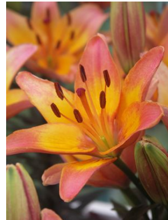
Asiatic lily 'Ladylike'