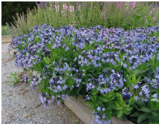
Amsonia 'Blue Ice'

Last on my list is another spectacular entry, the ' Grand Mum ' Monarda. This plant delivers clumps of aromatic dark green foliage and light pink-mauve flowers that are frilly. These flowers reminded me of the lacinated dahlias that I grow. They are disease resistant, grow to about 16", and can be deadheaded for more blooms.