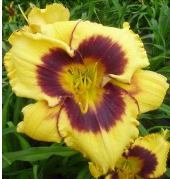
Daylily 'Calico Jack'