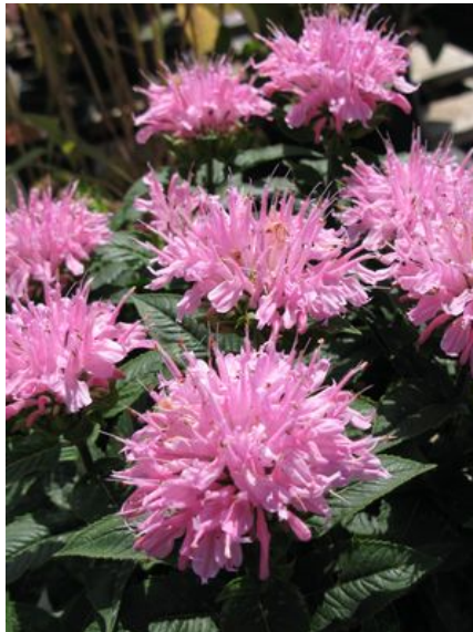
Monarda 'Grand Mum'