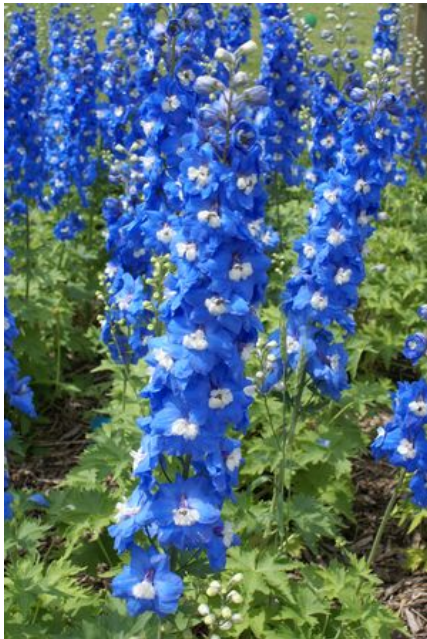
Delphinium 'Aurora Blue'