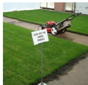
Bachman's is growing grass for the show!

Reservations are limited. Details were printed on pages 6-7 in the March Spray . Reservations are due by March 29 . See reservation form on Page 10 .