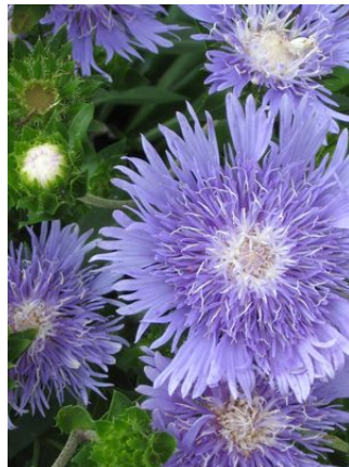
Aster 'Peachie's Pick'