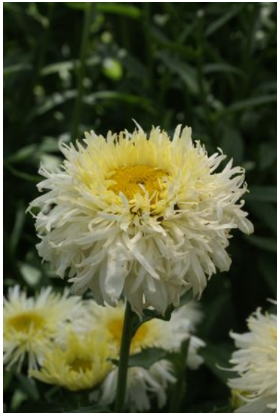
Shasta Daisy 'Gold Rush'