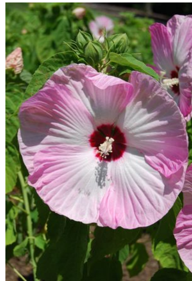
Hibiscus 'Luna Pink Swirl'