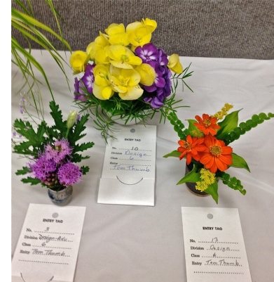
A sample of 2013 miniature design entries.

This year the FFF Show committee has elected to allow members' design creativity to really shine. All design classes are open to members' interpretations, though the miniature classes have a size constraint. Judy Berglund would be happy to help with ideas for newer members looking for guidance.