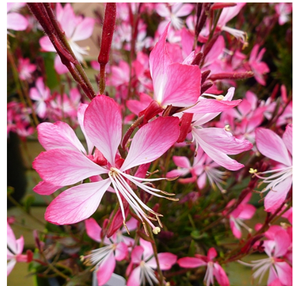
Gaura 'Little Janie'

Gaura 'Little Janie' Blooms all summer with pink flowers tipped in white that resemble butterflies.