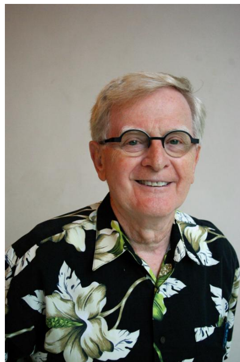
MWGCM Member since 1986