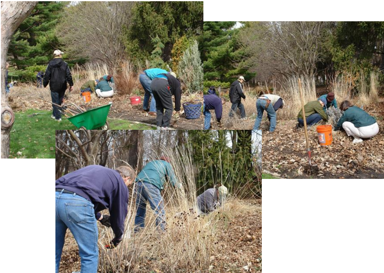
Flattering photos of workers' best sides

For more details contact mgcmgarden@q.com