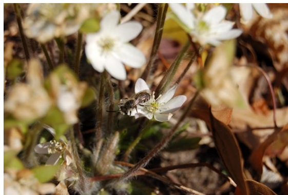
Early pollinator on sharp-lobed hepatica in the Native Garden.