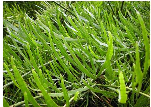
Homalocladium 'Ribbons and Curls'

* These plants were featured in the March Garden Spray .