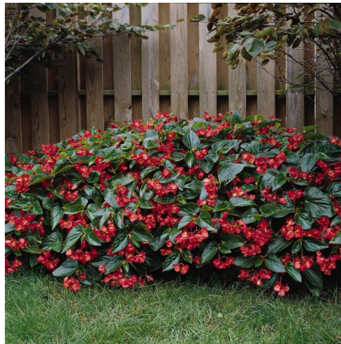
Begonia 'Dragon Wing' red

Oxalis 'Burgundy Gold' Pentas 'Graffiti Lipstick' Persian Shield Petunias 'Night Sky', 'Headliner Pink Star', 'Surfina Heavenly Blue', 'Surfina Deep Red', 'Tidal Wave Silver', 'Tidal Wave Red Velour' Plectranthus 'Zulu Wonder', 'Hillardiae Red' Purple Fountain Grass Rudbeckia 'Cherry Brandy' Salvia 'Black, Blue', 'Hotlips', 'Argentea', 'Sallyfun™ Snow White' Scaevola 'Diamond' Setcrecea 'Purple Heart' Shrimp Plant (bright yellow flower) Snapdragons 'Day and Night' Solanum Jasminoides 'Variegata' Sweet potato vine 'Camouflage', 'Blackie', 'Margarita' Talinum (Jewels of Opar) Texas Hummingbird Sage Verbena 'Lanai', 'Twister Pink', 'Homestead Purple', 'Bonariensis' Vinca 'Wojo's Gem' Wire vine (muelenbeckia) Zinnias Scabiosa mix, 'Whirly Gig', 'Elegans Pinca', 'California Giant', 'Hidden Dragon', 'Peppermint Stick', 'Cactus,' 'Masurkia'