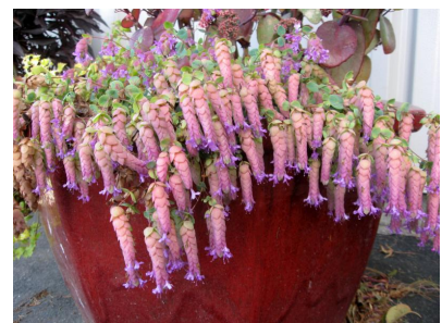
Origanum 'Amethyst Falls'