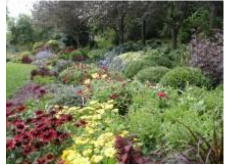
Lyndale Park/Mixed Border Garden 2013

For the past 10 years I have been the chair of the Lyndale Park Garden Committee. From 2002 to 2005, it was called the Perennial Garden Committee. Last year club members formed a new garden committee also located in Lyndale Park. They focus on growing pollinator friendly native plants, and picked the name Native Garden Committee.