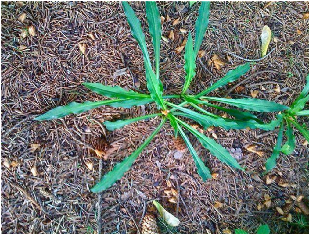
Hosta Seedling probably from H. 'Stiletto'

I also found two Hosta seedlings not too far away from a H 'Stiletto'. See the image below.