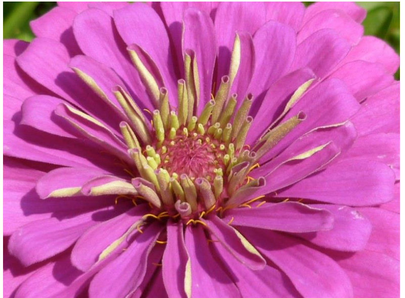
One of the winning photos from 2012 show by Lloyd Wittstock

Step up to the plate; share your photos for both parts of the contest or for just one. We will take less than 20 if you only want to send a few. At least send us some. And we'll see your favorite plant, garden, wildflower, landscape or vacation photos at the Arboretum on August 17 and 18. So do like you learned in kindergarten and share.