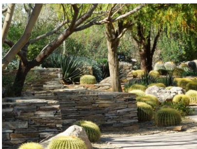
Cactus Garden by Audrey Grote 2012

For inspiration, here are a couple of winning photos from previous years. For even more inspiration, go to our website and click on "Photo Show Winners". You'll see slide shows of photo contest winners back to 2003.