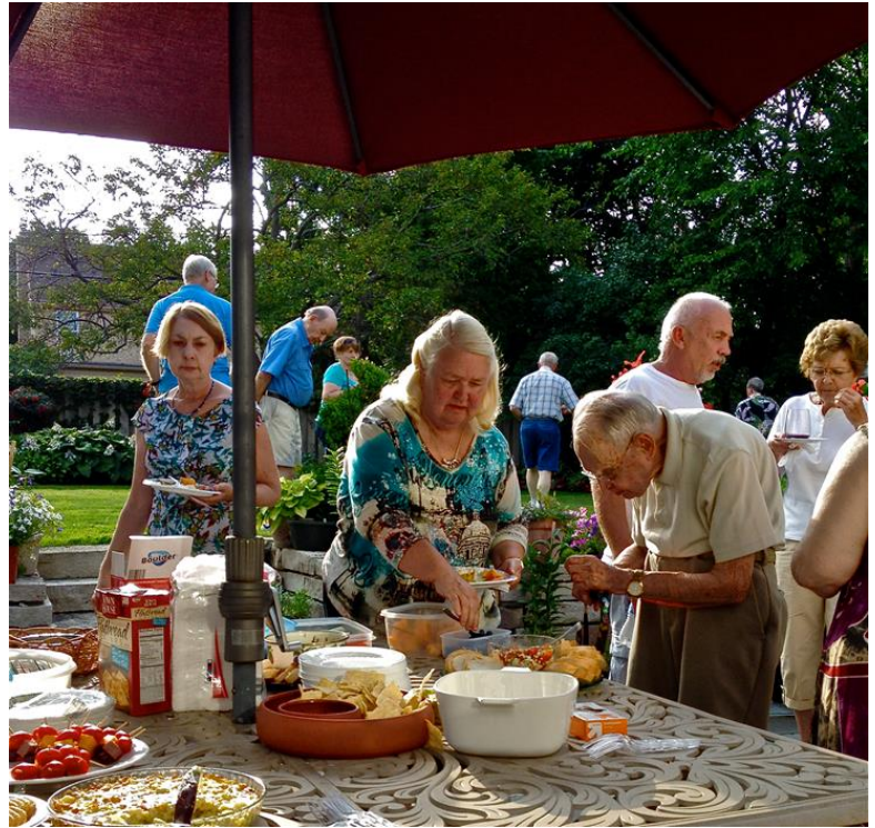
Appetizers at Bob Olson's Garden on August 5