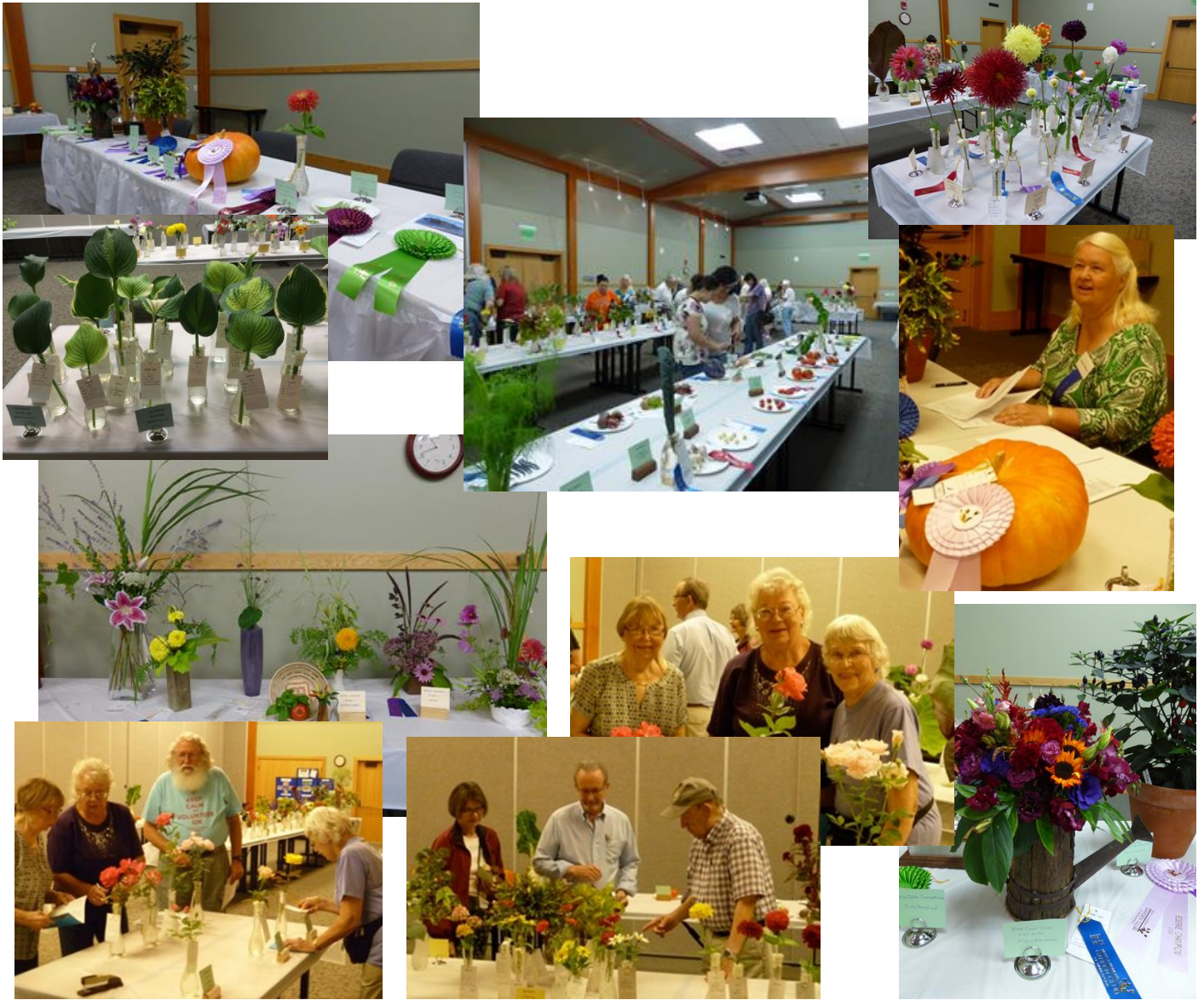
Foto Contest Results