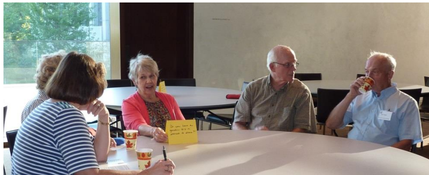
A few members (and one Auxiliary member) preparing for dinner at the September meeting.

Thanks for all your help, and bon appetit!