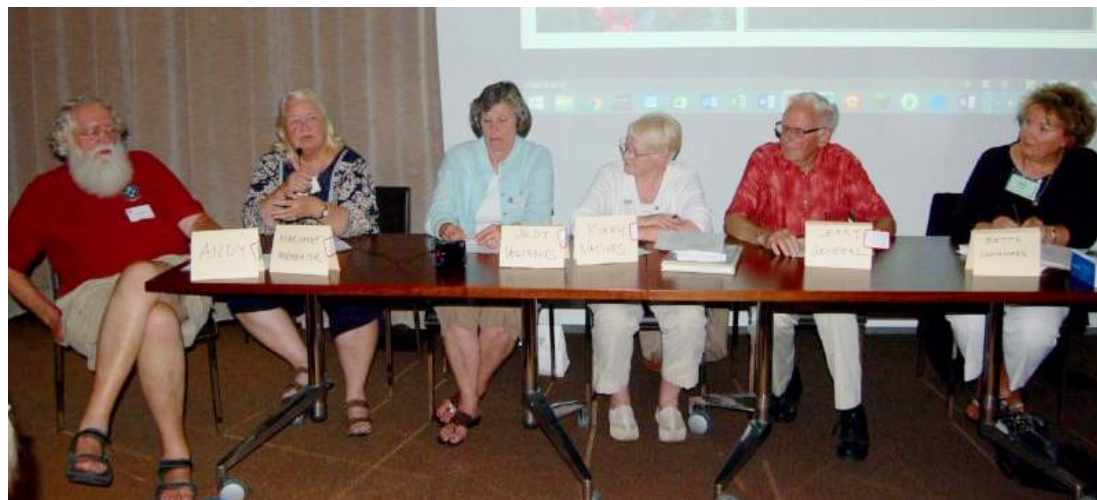
Our panel of experts at the September meeting.

The 75th Anniversary committee has planned a special celebration for the October 10 meeting. The MWGCM was chartered by the Men's Garden Clubs of America as the Men's Garden Club of Minneapolis on October 1, 1942. Seventy-five years later we have evolved into the Men's and Women's Garden Club of Minneapolis and our membership spans the entire metro area and beyond.