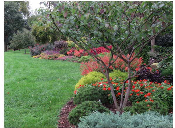
A Pagoda Dogwood resides in Pagoda Bay.