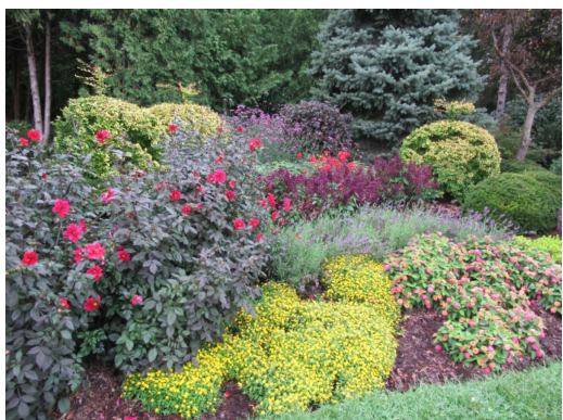
Decoratively pruned golden barberries distinguish Pineapple Bay.

At last summer's "Evening in the Gardens," committee members who create the public gardens in Lyndale Park answered questions as other club members toured. Mixed border committee members were standing in the various garden "bays" holding signs with the bay name. One question I heard was "What is a bay?"